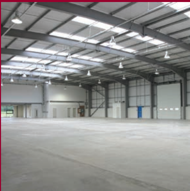
Indicative images only