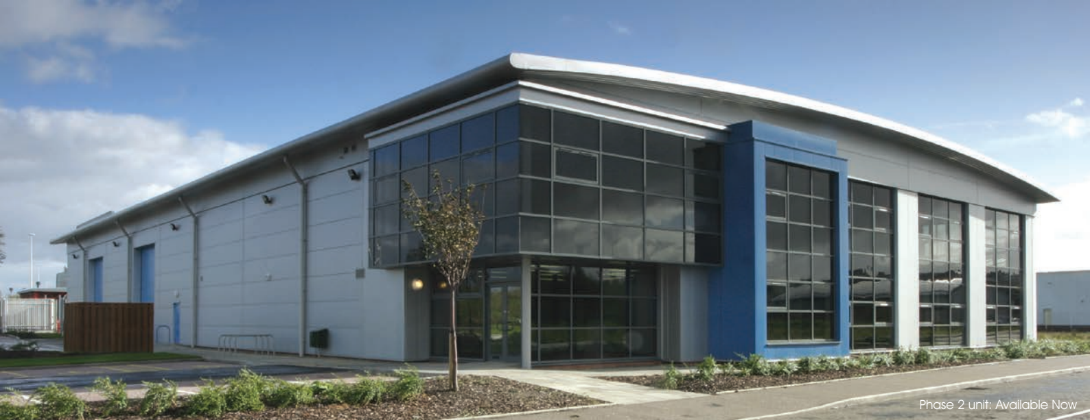
Phase 2 unit: Available Now